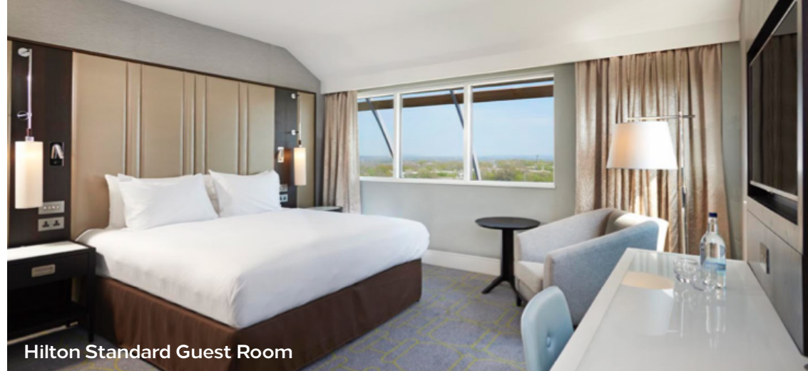
Hilton Standard Guest Room

You will be eligible for a 15% discount off our best available rates inclusive of breakfast (subject to availability).