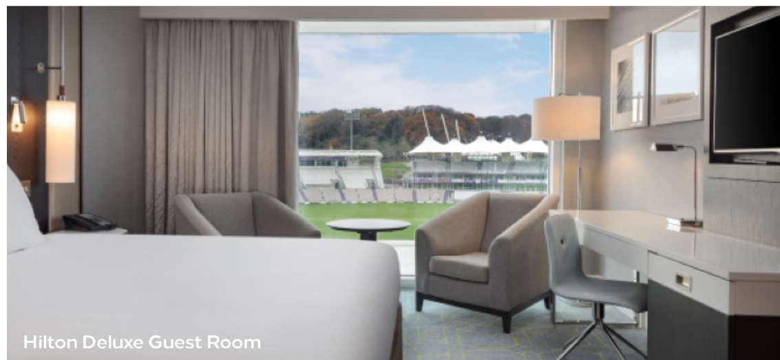
Hilton Deluxe Guest Room